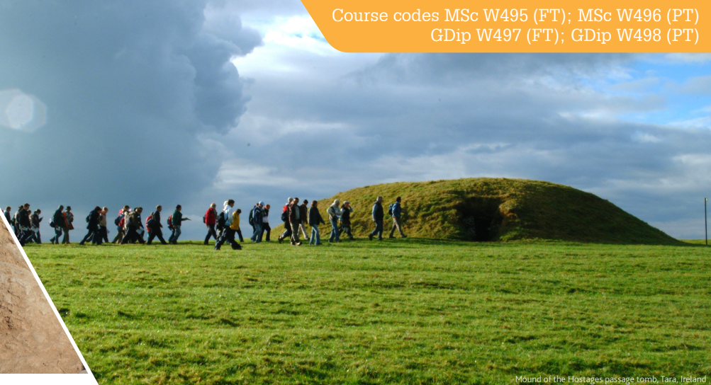
Mound of the Hostages passage tomb, Tara, Ireland