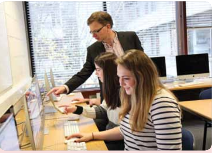
UCD Psychology students acquire skills in software tools for research.